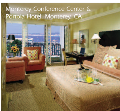
Monterey Conference Center & Portola Hotel, Monterey, CA

Mail or Fax Completed Registration and Payment To: California Society of Dermatology & Dermatologic Surgery 980 9th Street, PMB #1654, Sacramento, CA 95814 (866) 337-DERM (3376) Ph ■ (916) 244-0330 Fax membership@calderm.org ■ www.calderm.org